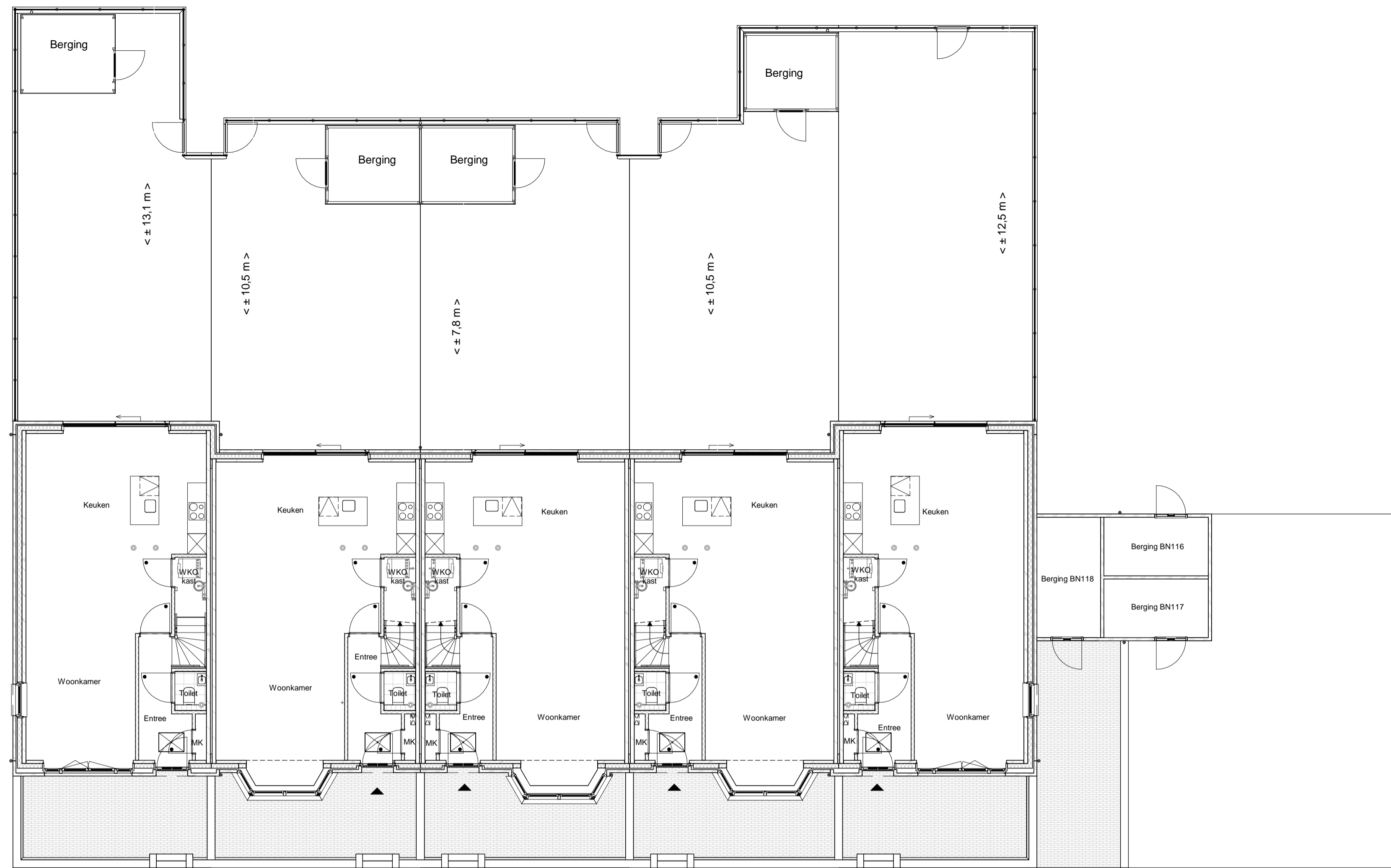
Begane grond BN122 BN121 BN120 BN119 BN118